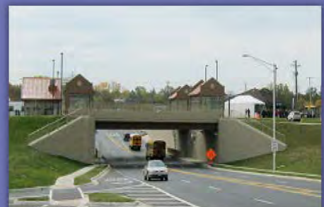
A recently completed CREATE grade separation in Downers Grove on Belmont Road at the BNSF Railway